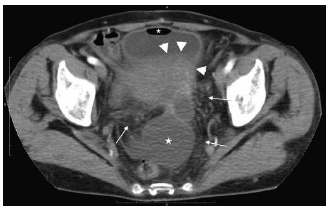
Fig. 2: Y – CT axial slice showing the bowel-bladder thickened walls (arrowheads) with consensual surrounding adipose tissue effusion (arrows). Air-fluid level is clearly evident inside the bladder (asterisk) and reactive fluid trasudate inside the Douglas pouch (star).